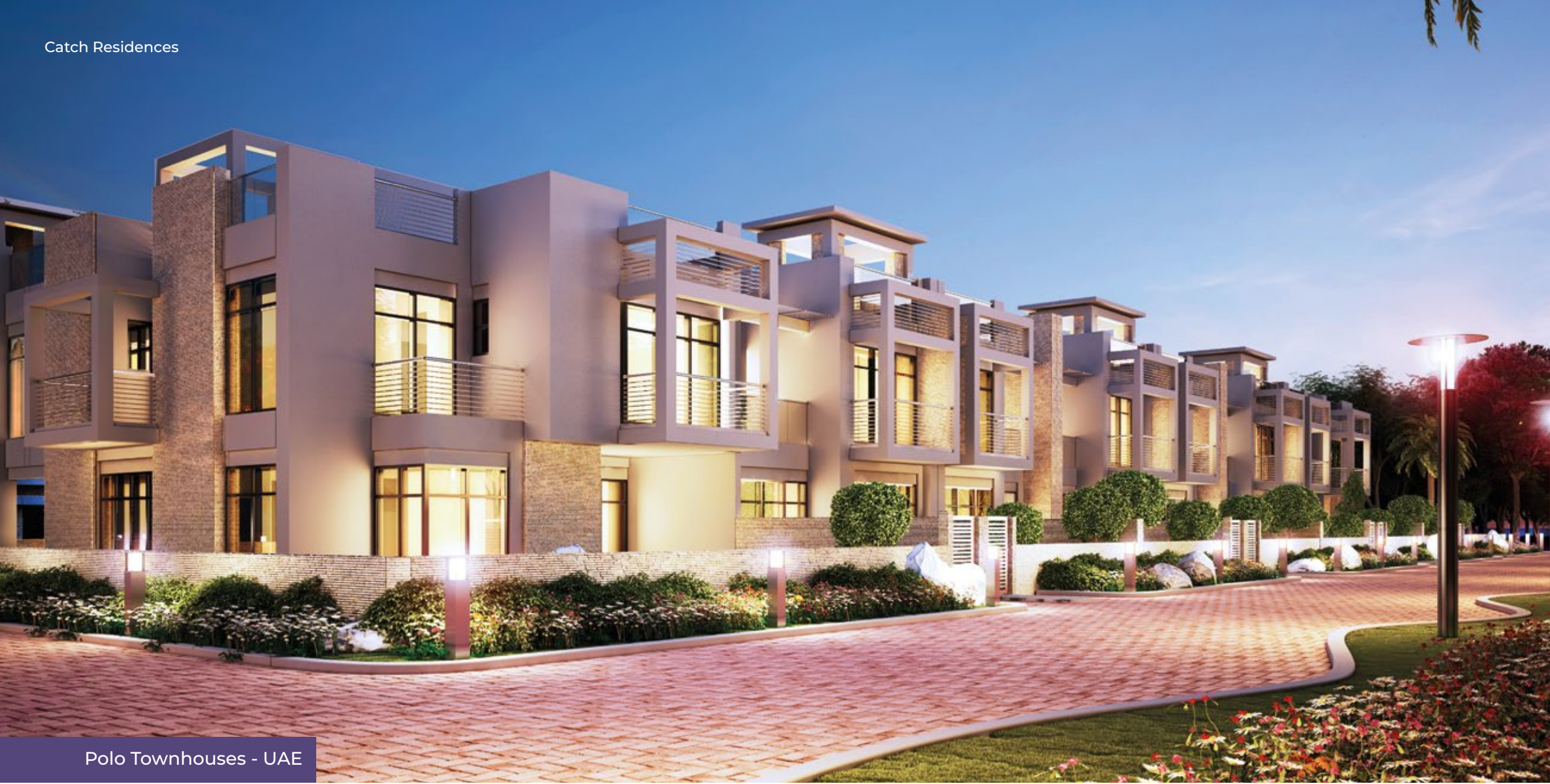
Polo Townhouses - UAE