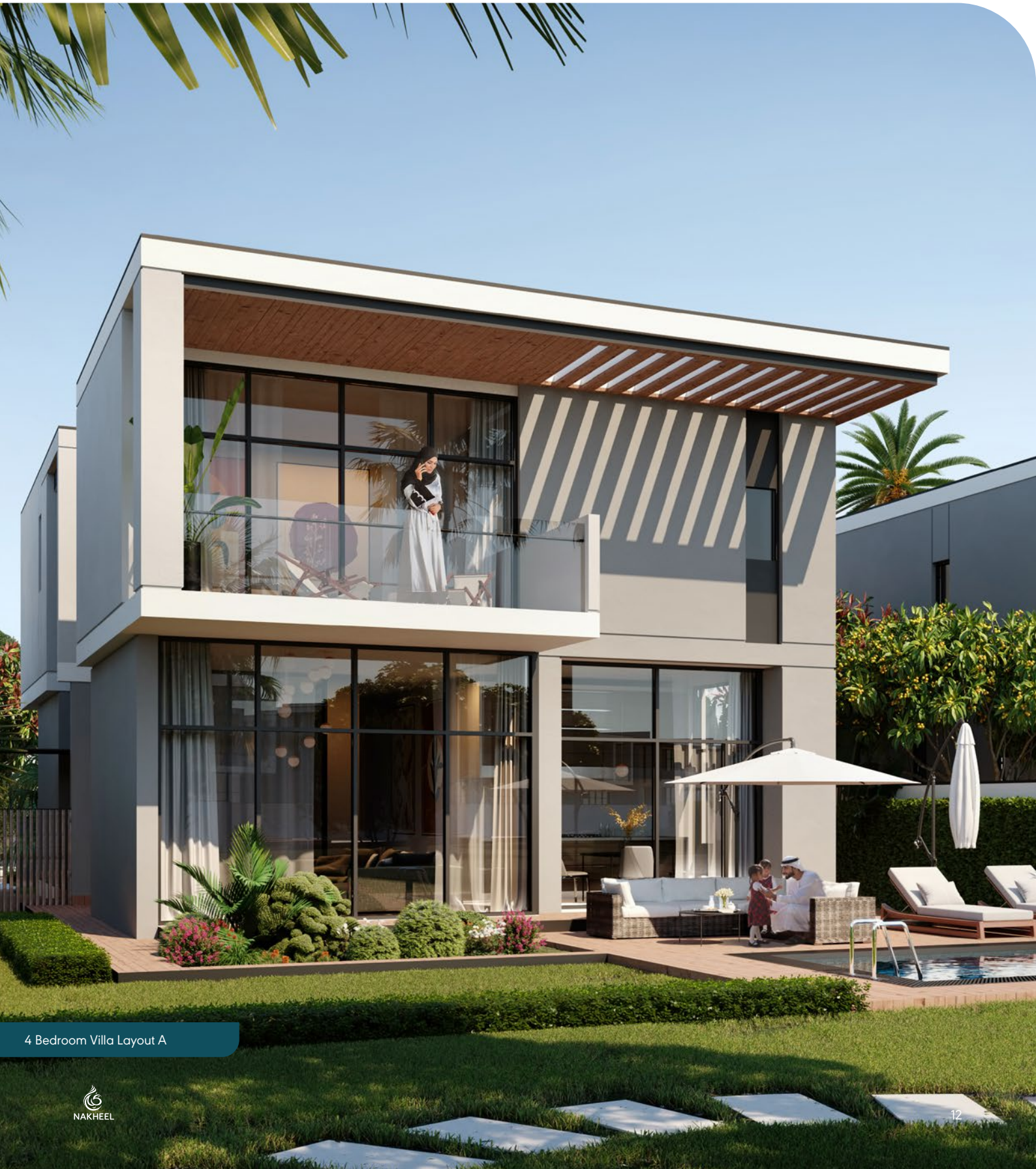
4 Bedroom Villa Layout A

The four bedroom villa design retains all the elegance and modernity of the five-bedroom villa designs. These homes still feature a garage with space for three cars, an elevated large shaded balcony that overlooks the rear garden and a swimming pool.