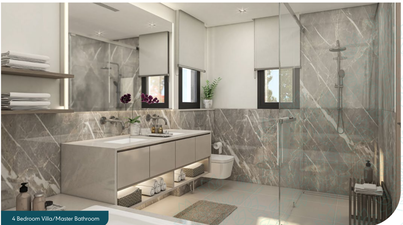
4 Bedroom Villa/Master Bathroom