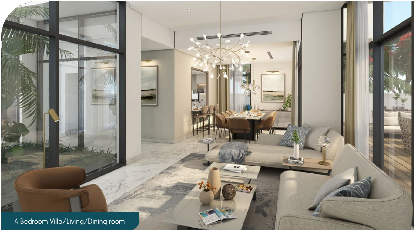
4 Bedroom Villa/Living/Dining room

From inside to poolside, attention to detail has made itself at home in every element. The finest materials have been carefully selected and crafted to create exceptional finishes and an experience that makes you feel completely at home wherever you are within the development.