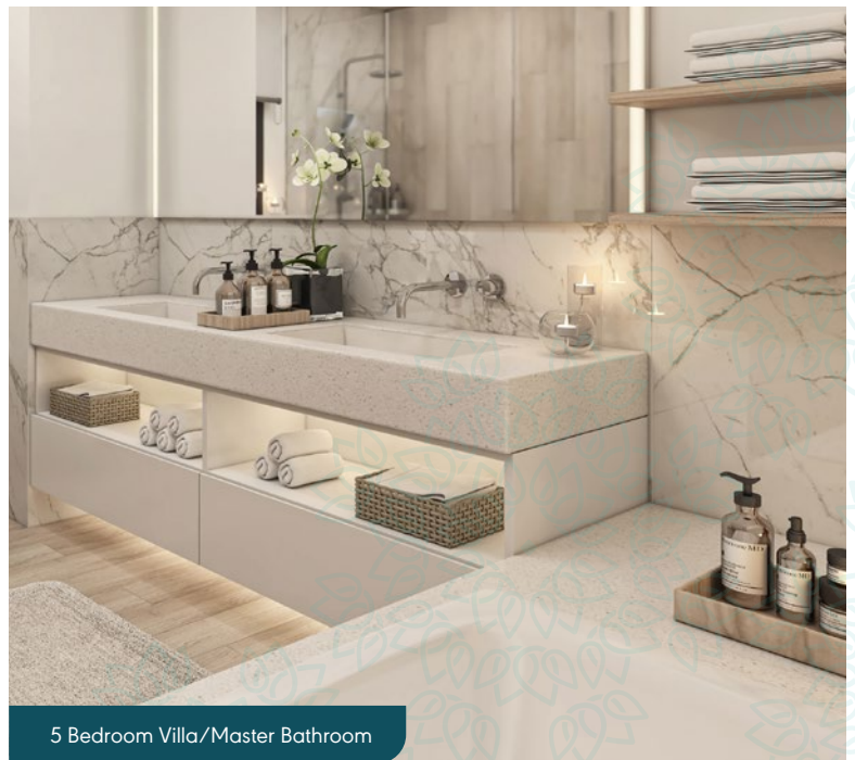
5 Bedroom Villa/Master Bathroom