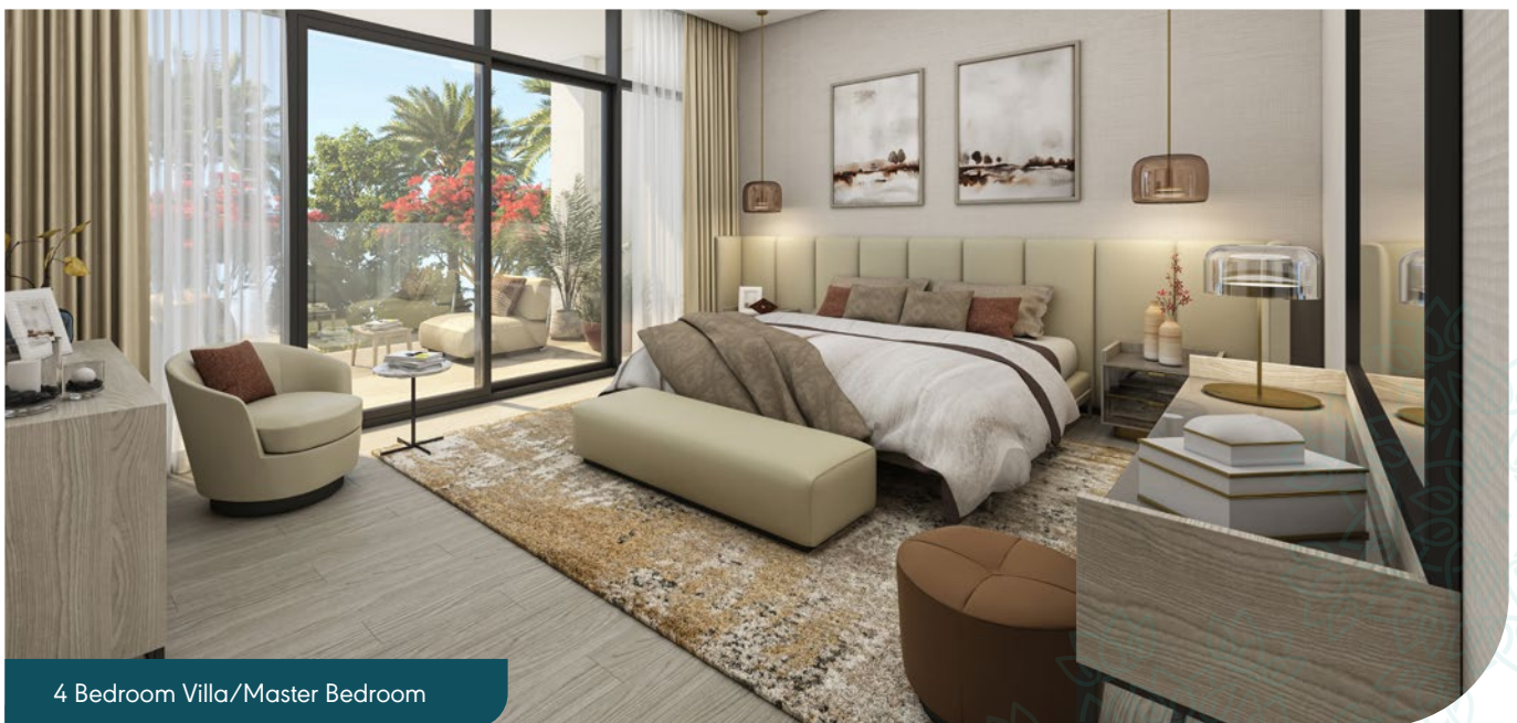
4 Bedroom Villa/Master Bedroom

The entrance foyer leads directly into the living area, benefitting from the natural light coming in through the floor-to-ceiling glazing and offering a view of the rear garden. On the ground floor is a closed kitchen, ample storage space, a maid's room and a guest bedroom with bathroom.