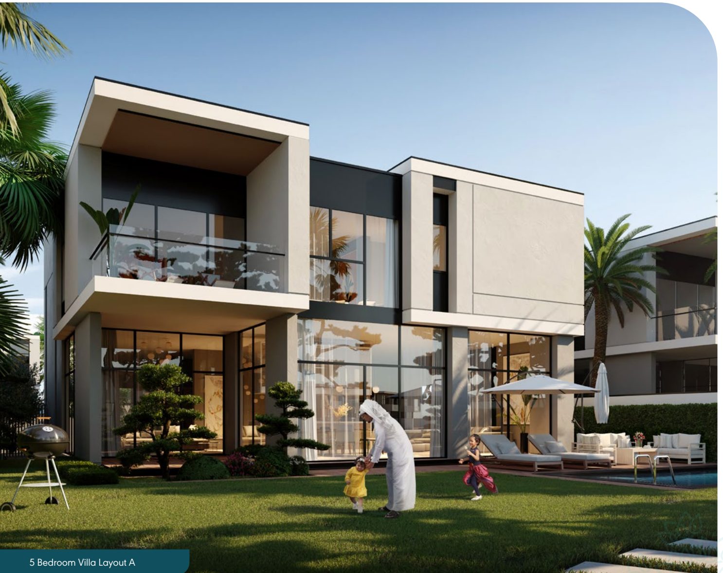
5 Bedroom Villa Layout A

In the designs of the five-bedroom and four-bedroom villas, modernity speaks volumes. A grand entrance foyer offers a welcoming and impressive greeting area that leads to an expansive living room with floor-to-ceiling windows framing stunning views of the garden.