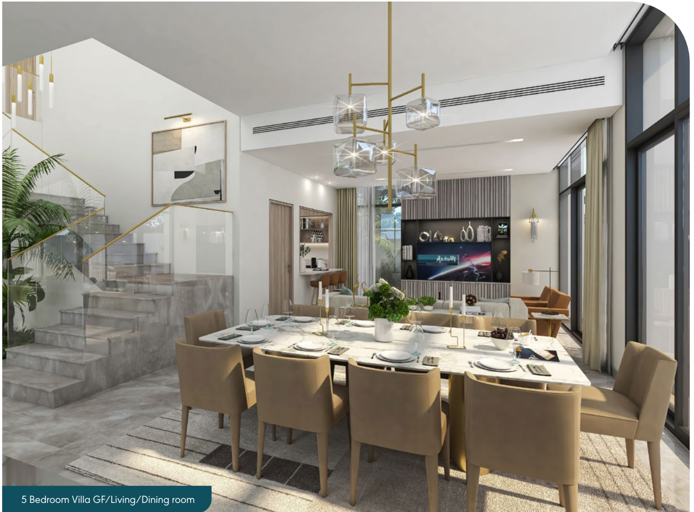
5 Bedroom Villa GF/Living/Dining room