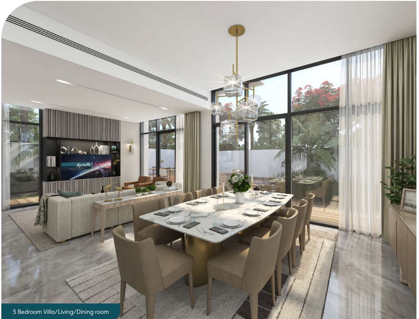
5 Bedroom Villa/Living/Dining room