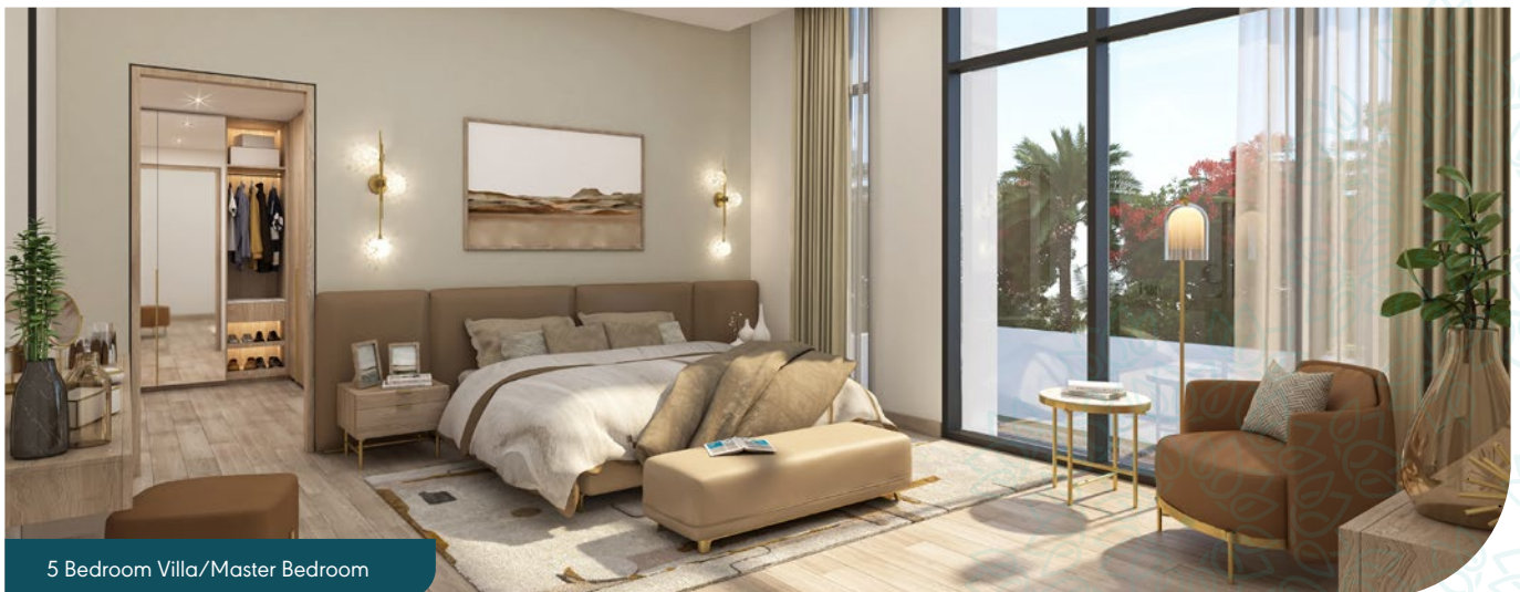
5 Bedroom Villa/Master Bedroom

Villas are available with a choice of layout options and the opportunity to design a home that uniquely suits you.