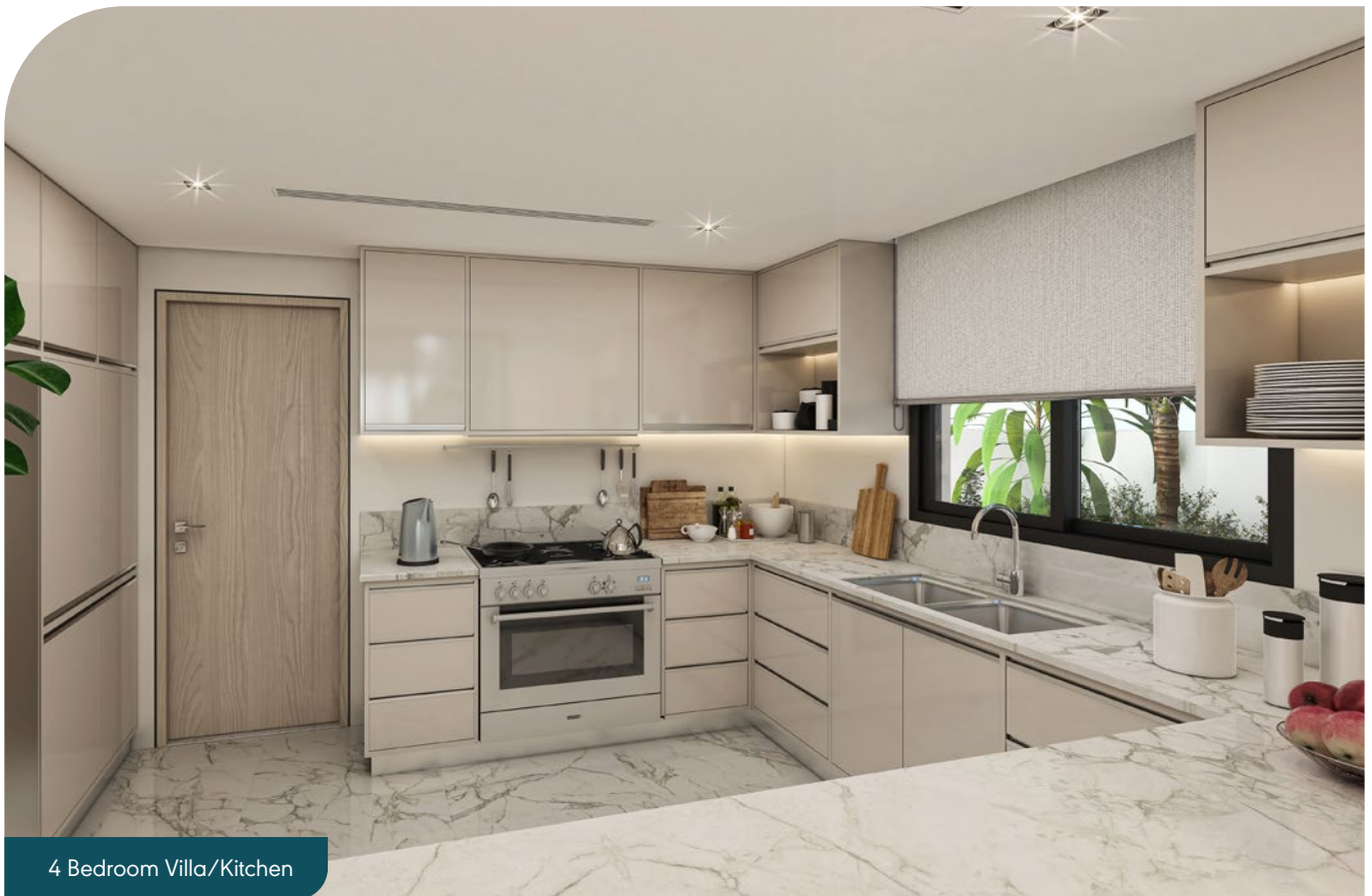
4 Bedroom Villa/Kitchen