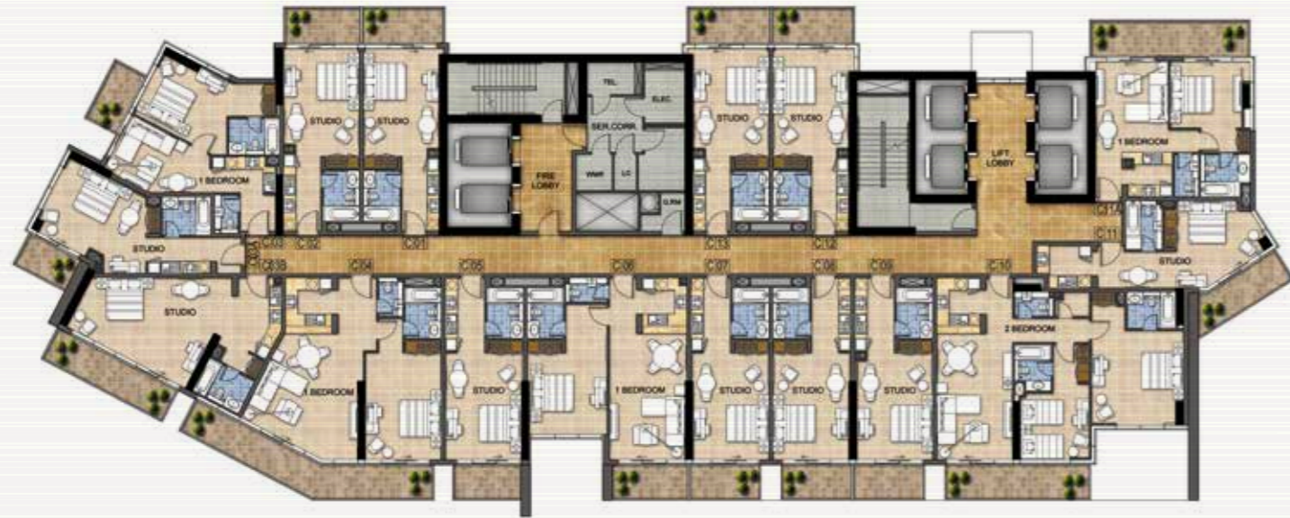
LEVELS 4-7 9-10 12-13 & 15