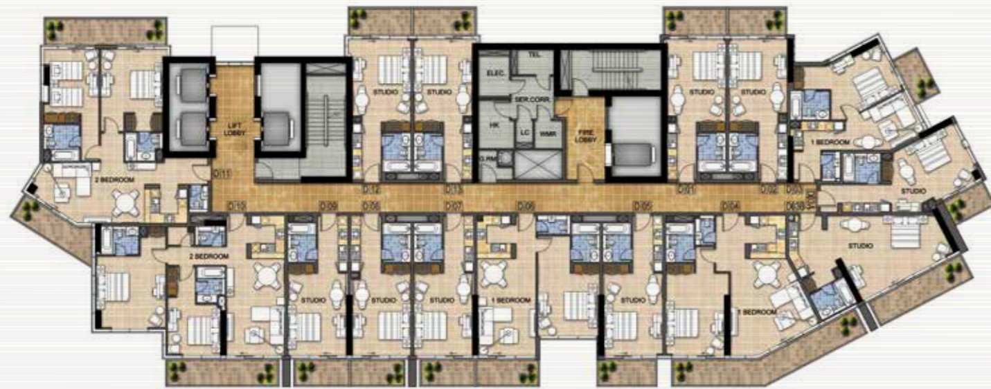
LEVELS 4-6 9-12